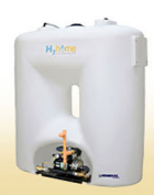
13D PUMP & TANKS