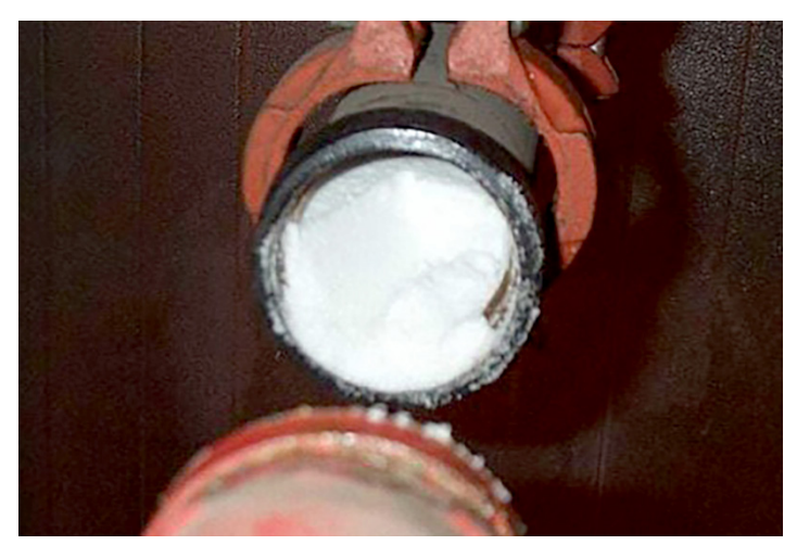
This ice plug is a result of pulling air from the freezer room. For this reason, Standard compressed air should never be used in a freezer room or cooler.

There are three technologies available for filling dry pipe and pre-action sprinkler systems – standard compressed air, dry air generators – such as the Dry Air Pac® - and nitrogen generators. General Air Products is the only company in the fire sprinkler industry that manufactures all three of these types of equipment. This puts us in a unique position to speak to the pros and cons of each technology given a specific application. So, the first thing to take away here is that all of these products – compressors, dry air generators and nitrogen generators – have positives and negatives when applied to a dry pipe or preaction system in any type of building.