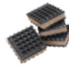
Vibration Isolation Pads