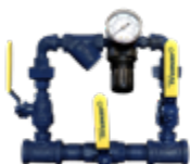
Part # AMD-1

Required to regulate the volume of air being delivered to the sprinkler system. General Air Products Air Maintenance Devices are UL listed & FM approved.