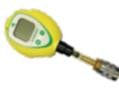
Portable N2 Analyzer