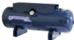
10 Gallon N2 Storage Tank