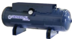
10 Gallon N2 Storage Tank