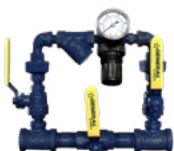
Part # AMD-1

Required to regulate the volume of air being delivered to the sprinkler system. General Air Products Air Maintenance Devices are UL listed & FM approved.