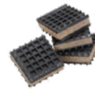
Vibration Isolation Pads