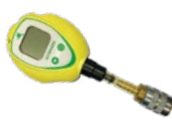
Portable N2 Analyzer