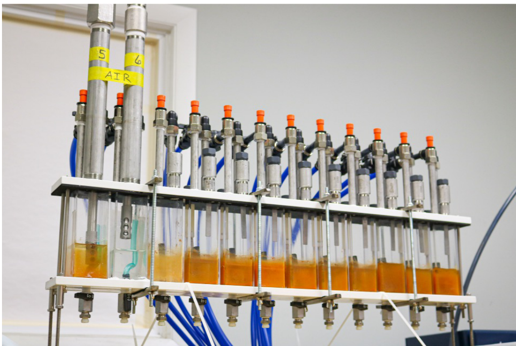
12 chambers partially filled with water where coupons made from C1018 carbon steel are submerged.