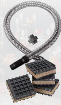
Includes Vibration Pads, 30" Stainless Steel Flex Hose & Union.